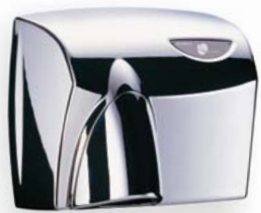
Autobeam with full polished chrome cover and nozzle AUTOBEAM-PCCH

Unique to this range is an all chrome model. This striking looking automatic hand dryer, is a dramatic deviation from the otherwise understated 1000 series range. This variation allows design and architects access to a hand dryer that can easily serve as the focal point for the bathroom.