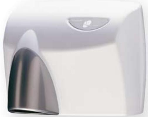
Autobeam with silver gloss nozzle AUTOBEAM