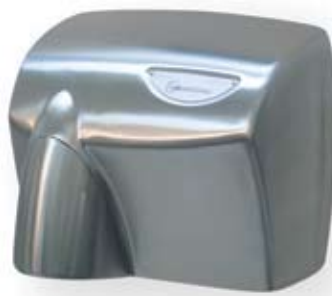
Autobeam with full satin chrome cover and nozzle AUTOBEAM-SCCH

The Touchdry range of hand dryers feature a solid touch button mechanism, which improves feedback to the user and there is no confusion if the hand dryer has been manually activated.