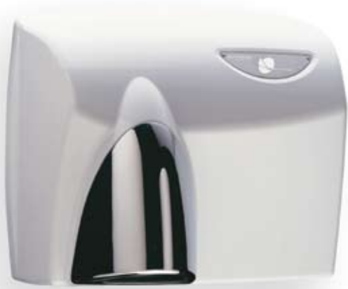
Autobeam with polished chrome nozzle AUTOBEAM-PC