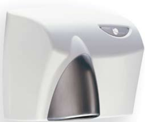
Autobeam with satin chrome nozzle AUTOBEAM-SC

The Autobeam range of hand dryers features improved sensor accuracy, making it easier to activate.