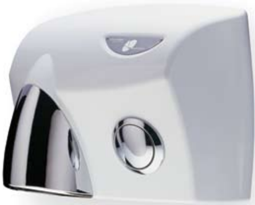
Touchdry with polished chrome nozzle and button TOUCHDRY-PC