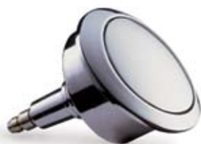
Solid touch button