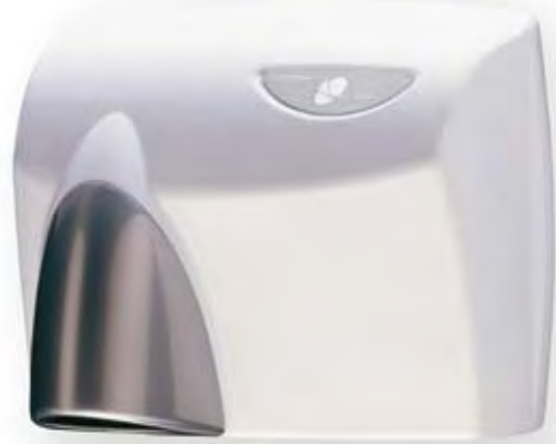
Autobeam with silver gloss nozzle AUTOBEAM