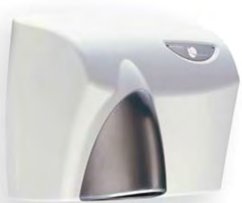
Autobeam with satin chrome nozzle AUTOBEAM-SC

The Autobeam range of hand dryers features improved sensor accuracy, making it easier to activate.