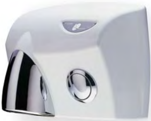
Touchdry with polished chrome nozzle and button TOUCHDRY-PC