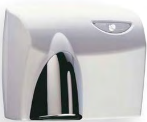
Autobeam with polished chrome nozzle AUTOBEAM-PC