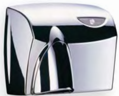
Autobeam with full polished chrome cover and nozzle AUTOBEAM-PCCH

Unique to this range is an all chrome, model. This striking looking automatic hand dryer, is a dramatic deviation from the otherwise understated 1000 series range. This variation allows design and architects access to a hand dryer that can easily serve as the focal point for the bathroom.