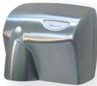
Autobeam with full satin chrome cover and nozzle AUTOBEAM-SCCH

The Touchdry range of hand dryers feature a solid touch button mechanism, which improves feedback to the user and there is no confusion if the hand dryer has been manually activated.