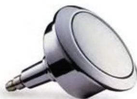
Solid touch button