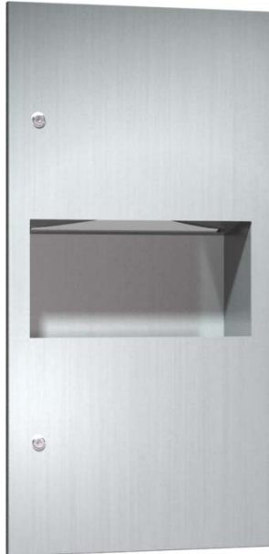
Shown: Recessed Model No. 64623 Surface Mounted unit includes a trim