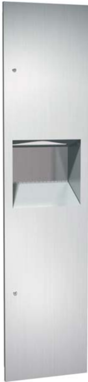
Shown: Recessed Model No. 64676 Surface Mounted unit includes a trim