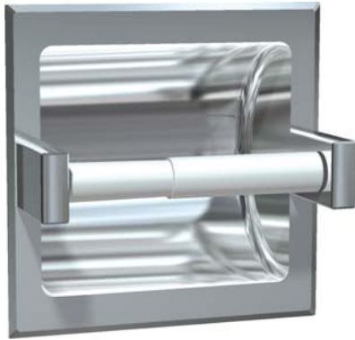
Shown: Model No. 7402-BD