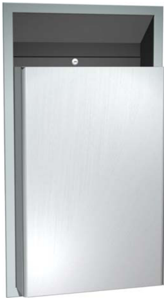
Shown: Semi- Recessed Model No. 0458 Surface Mounted unit includes a trim